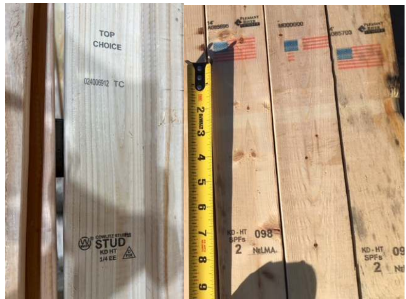
Figure 2 — Labels using terms that are clearly non-ALSC terms like "Top Choice" and a reproduction of the American flag.