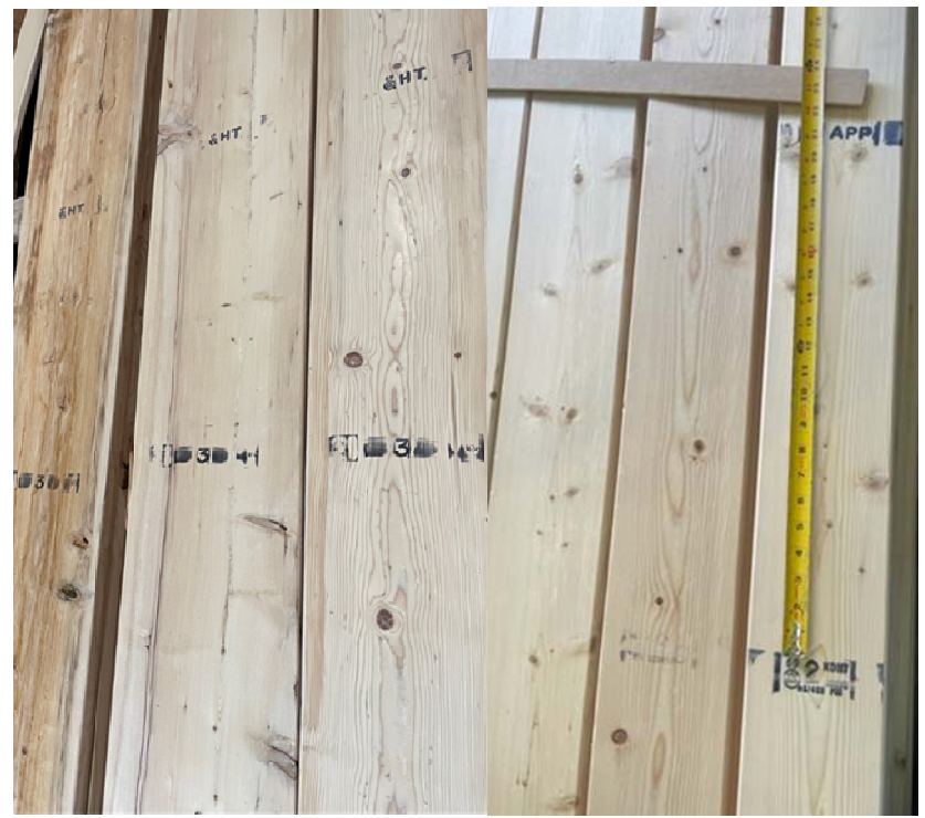
Figure 1 — shows examples of marking grade nomenclature in the applicable accredited agency's rule book even though the boards are not being graded according to the grade designation. The stamped information 3 and APP label are present on lumber when not being graded according to 3 or APP rule.

Situation: A request has been made to further clarify what information included on ALSC-stamped products by an ALSC accredited agencies subscriber would be considered a confusing or deceptive marking. Note that in general products are permitted to be stamped with marketing and other language provided that such other information is at least six inches from the grade-stamp and such other information is not confusingly or deceptively similar to the grademarks of an ALSC-accredited agency. ALSC staff has observed several examples of labels located greater than 6 inches from the grade stamp which may be considered confusingly or deceptively similar to ALSC-accredited agency grademarks (Figures 1-3).