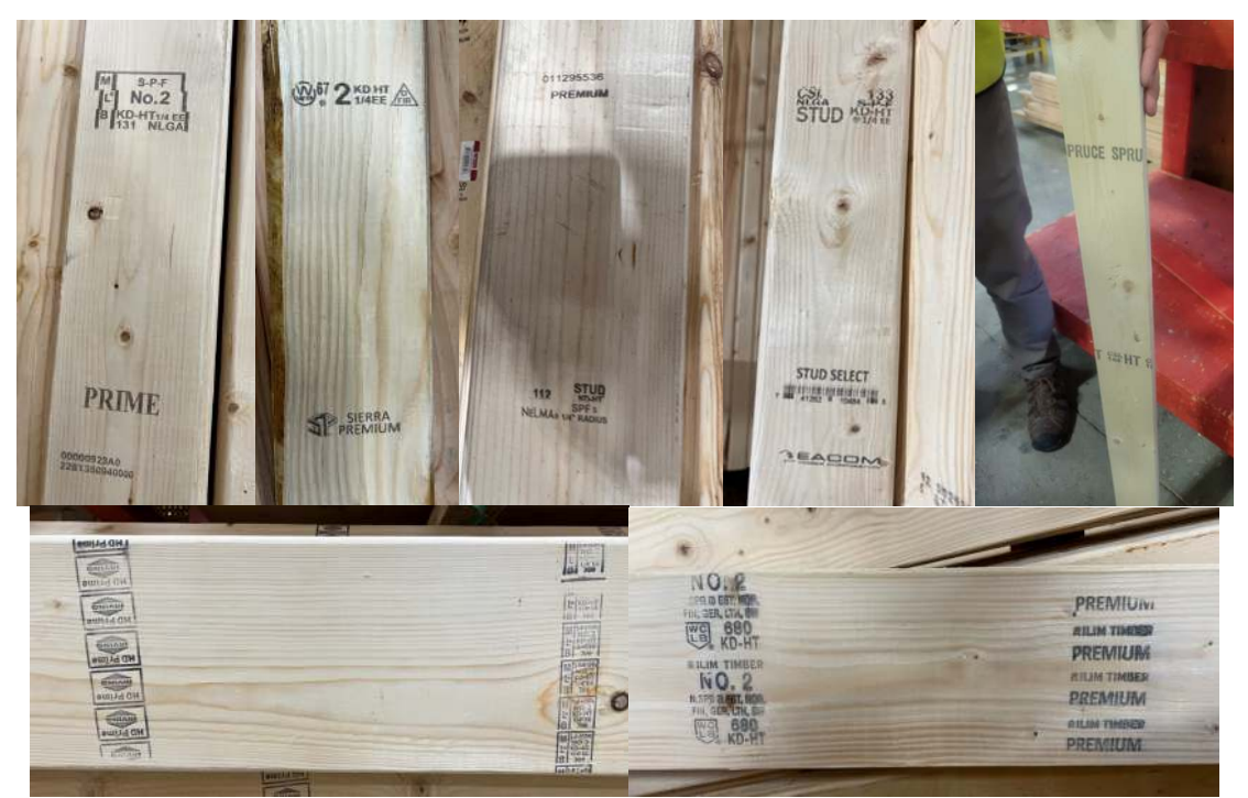
Figure 3 – Shows several examples that illustrate use of ALSC grade terms "Prime", "Premium", "Select", or species on lumber even though these terms may not be in the particular agency's rule book.

ALSC staff response: ALSC staff will object if there is wording or symbols that reflect the species, grade name, moisture content, or phytosanitary treatment on a product (the "Product Marking") that is included in the book of the rules-writing agency under which the product has been graded